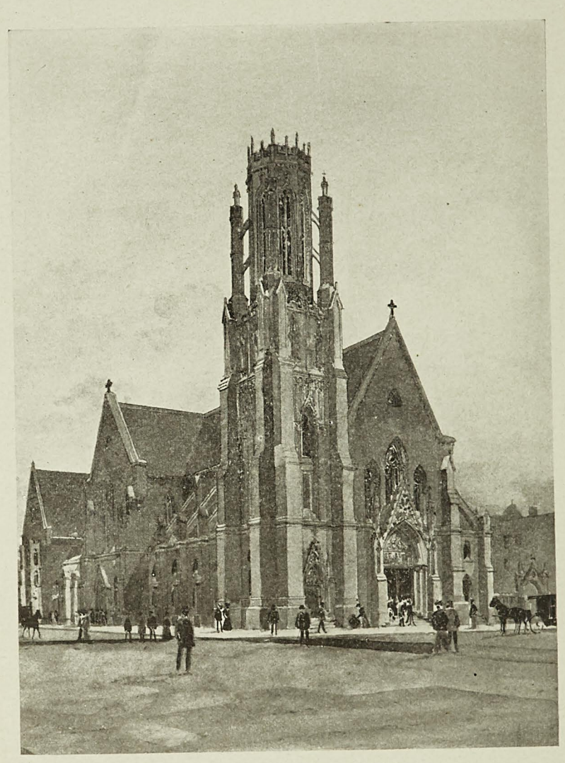
CHRIST CHURCH CATHEDRAL, St. Louis.