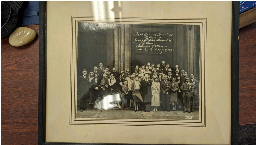
Young Adults in the Episcopal Diocese of Missouri in 1931