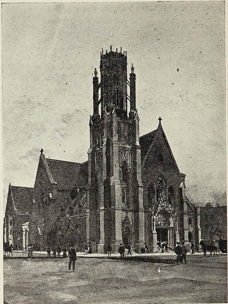
CHRIST CHURCH CATHEDRAL, ST. LOUIS.