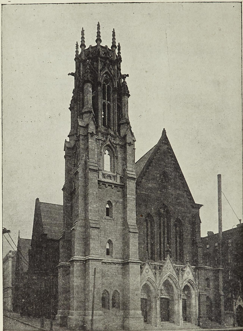
CHRIST CHURCH CATHEDRAL, ST. LOUIS.