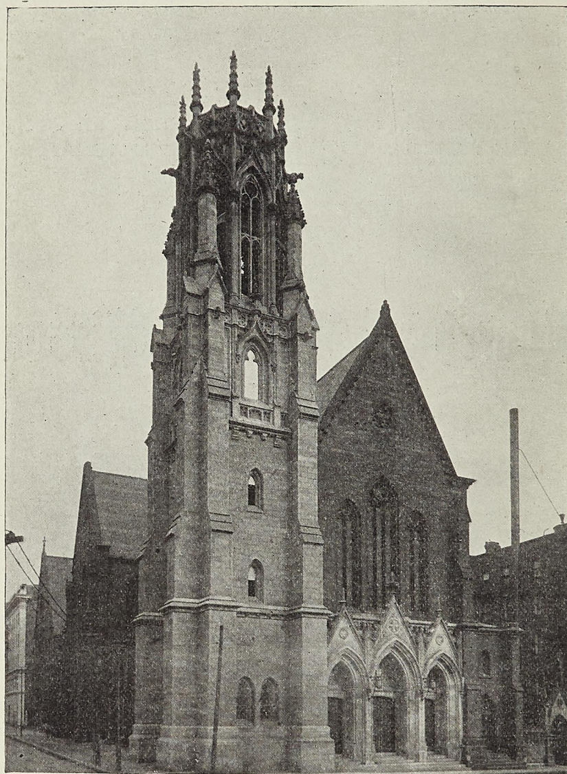
CHRIST CHURCH CATHEDRAL, ST. LOUIS.