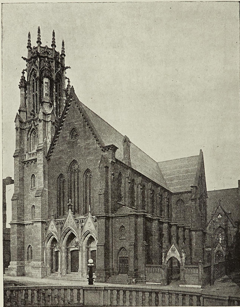
CHRIST CHURCH CATHEDRAL, ST. LOUIS.